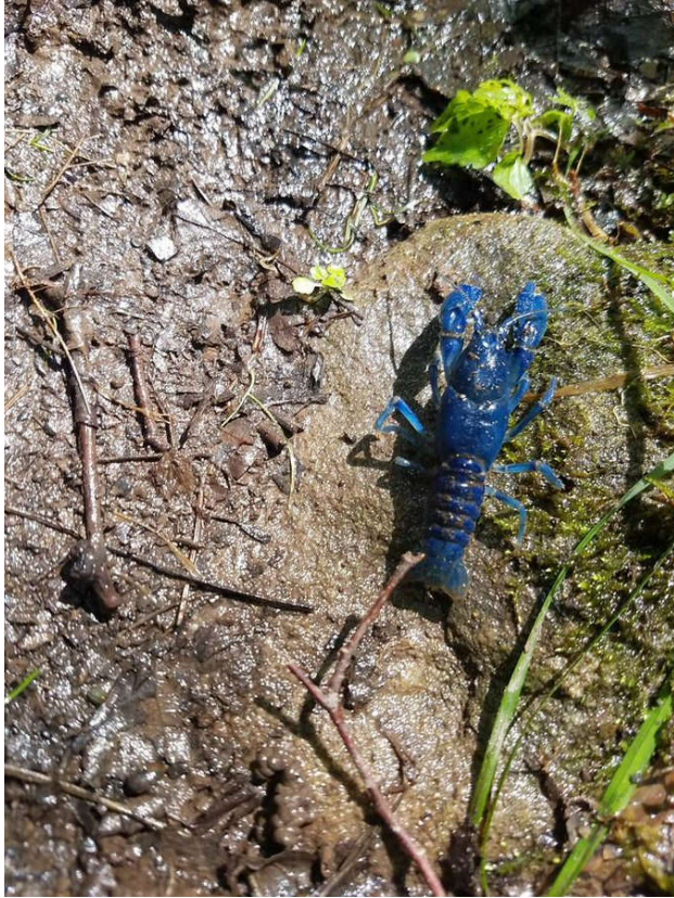
Blue Crayfish (from dept of Interior)

April 18-20 Polk County Fairgrounds Rickreall OR, Willamette Agate and Mineral Society